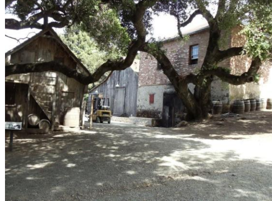
Winery Grounds

After the Vappu party that introduced us to the picturesque mountain hideout that is the Picchetti Winery in the far Cupertino hills, our movers and shakers decided that it would be the ideal place for our Fall event on September 19, and so it was.